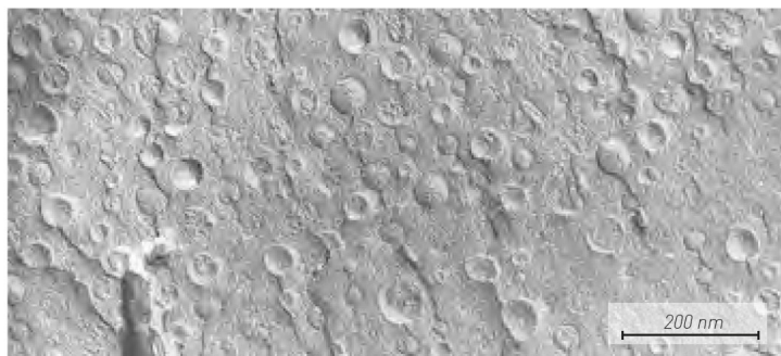
Fig. 6: Freeze fracture electron microscopy image of PhytoSolve® 4021.